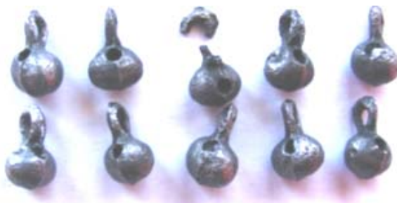
Fig. 3. Buttons B2 found in 2006 at Ibida

The objects were analyzed by EDX and micro-FTIR techniques without sampling