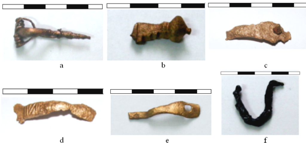
Fig. 1. Fibula fragments found at Ibida in 2002: a – F1; b – F2; c – F3; d – F4; e – F5; f – F6.

- Fibula fragment - F6 (Fig. 1f), discovered in the same place, year and area as the ones above, but -0.35 m underground and in square 10. Its inventory number is 45848 and it is in a poor state of preservation. It is a fragment consisting only of a loop from the fibula body and a small part of the bottom. The exaggerated arching of the loop apparently happened after its abandonment. The item was found in the soil used as filling for the tomb, a fact indicating an origin prior to that of the items above. The measurements for the item are: 21.70 mm for the amplitude of the loop, 15.40 mm for its opening and a weight of 3.76 g.