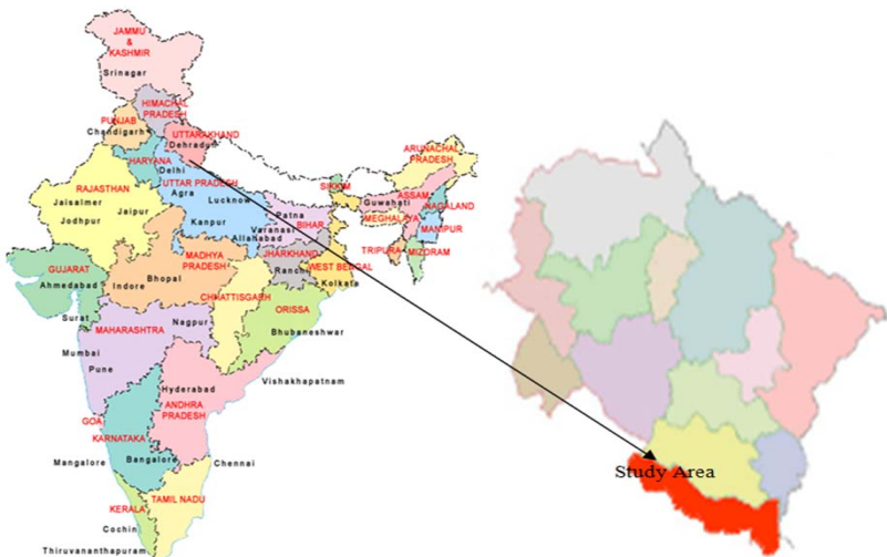
Fig. 1. Map of India and the study area (Udham S. Nagar District)

monthly maximum temperature ranged from 16.7 \pm 2.26^\circ\text{C} to 38.0 \pm 0.70^\circ\text{C} and minimum temperature was in the range of 8.2 \pm 1.20 to 23.4 \pm 0.98^\circ\text{C} (Table. 1).