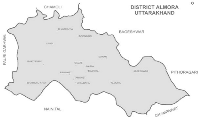
Fig. 1. Map of Study site

Uttarakhand (India) and the information provided by the secondary sources [20] and available literature [21] three forest stands(500-1200m, 1200-2000 m, 2000-2800 m) were selected as Zone-1, Zone-2 and Zone-3 in the wide elevation range along the gradient of disturbances. Several field trips were undertaken for collection of plants.