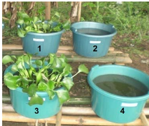
Fig. 2. Experimental device located at the University of Abobo-Adjamé: (1) and (4) Eichhornia crassipes in industrial wastewater effluents, (2) and (3) Same industrial wastewater effluents without any plants.

Effluents used of aquaculture experiment and plants were analyzed at initial level, 5 th , 10 th , and 15 th day (figure 2).