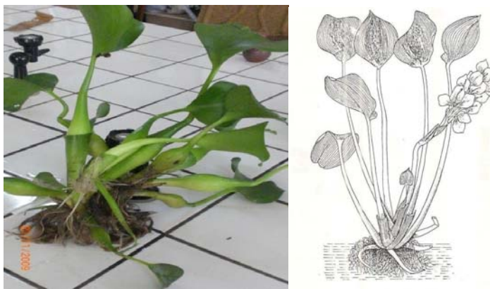
Fig. 1. Water hyacinth ( Eichhornia crassipes ), plant and graphic

Young plants of Eichhornia crassipes (Fig.1) were obtained from a local unpolluted pond located (GPS) in Côte d'Ivoire.