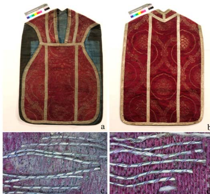
Fig. 1. Details of the textiles used in the experiment: a - front, b - back of chasuble from the collections of the Parish P.W. All Saints in Krakow, all before maintenance; c - fragment before wet cleaning; d - fragment after wet cleaning

The analysis of the state in which the textile was preserved demonstrated the presence of numerous off-white discolorations on the surface of the decorative silk fabric and darkening of the cellulose cotton fabric that lined the chasuble. These changes were the basis for microbial analyses (Fig. 1).