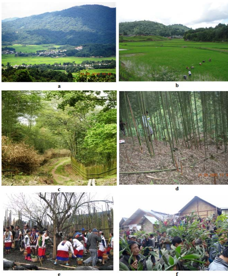
Fig. 2. Important features of Apatani culture and traditions: a. view of Apatani Plateau, b. traditional paddy field of Apatanis, c. a home garden with bamboos and Castanopsis sp., d. bamboo plantation in community forest, e. women folks performing rituals around the alter during Myoko festival, f. the traditional procession with cane leaves in Myoko festival