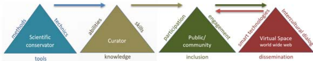
Fig. 1. The scheme of the main professionals and actors involved in the artifacts route from discovery to public display and virtual dissemination

After discovery, the conservator initiates a scientific investigation of the artifact, using specific methods, techniques and tools necessary in processes of authentication, evaluation, establishment of conservation status, compatibility studies, monitoring behavior interventions for a given period and in continuous monitoring of developments of the conservation state [5, 6]. The results obtained are used in other specific activities, such as: typological classification and cataloguing, passive preservation (preventive), active preservation (curative), restoration and hoarding.