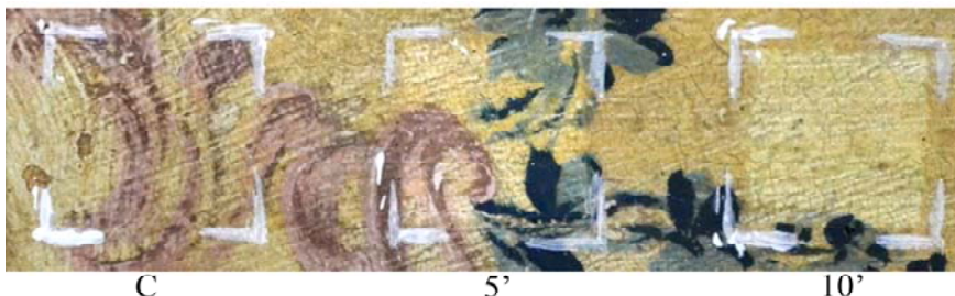
Fig. 3. Polychrome wood: C = Control (reaction solution without BMP, gelled by Klucel-G); bioremoval performed by application of gelled enzymatic solution for 5 and 10 minutes