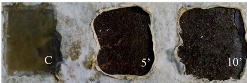
Fig. 2. Velinatura (Japanese paper + animal glue) from oil painting surface: C = Control (Gellan gel in the reaction solution); enzymatic removal performed by application of gelled enzymatic solution applied for 5 and 10 minutes

The bioremoval of both velinatura (Japanese paper bonded by animal glue) on ancient oil on canvas (Fig. 2) and animal glue layer from polychrome wood (Fig. 3), was successfully performed after 5 and 10 minutes of application at temperature < 30°C.