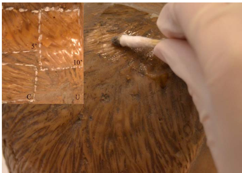
Fig. 4. Wax sculpture. U - Untreated area. C - control, reaction solution without BMP, gelled by Klucel G. 5'-10' - application of gelled enzymatic solution, by paintbrush, for 5 or 10 minutes. Right side = removal of gelled solution by cotton swab.

An altered protein layer was removed from wax sculpture surface after 5 and 10 minutes of application at 19°C (Fig. 4). Control test, performed applying the reaction solution without BMP, was also performed; results are showed in Table 2.