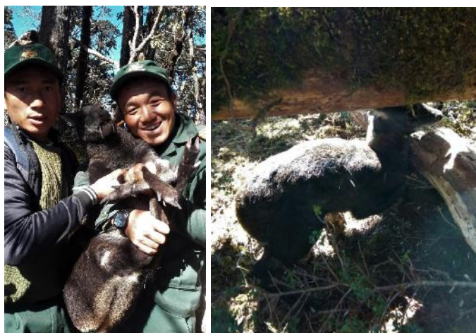
Fig. 3. Patrol team of Gasa Range rescuing and releasing male musk deer which was caught in the snares set by poachers.

Musk deer are generally found along the altitudinal range of 2500 to 4800masl [23]. In winter season, musk deer in JDNP were found distributed along the altitudinal gradient of 3171 to 4327masl (Fig. 3). Their distribution was mostly within fir forest since lichens (a primary winter food for the musk deer) were recorded plentiful in fir forest. The elevation range of 3600 to 3700masl was the most suitable winter habitat as the survey team recorded majority of musk deer droppings within this altitudinal range. The same was also indicated by the maximum number of snares set within this range. In Manaslu conservation area, from Nepal, A. Subedi et al. [24] showed that altitude range of 3600 to 3800m is the most suitable altitudinal range.