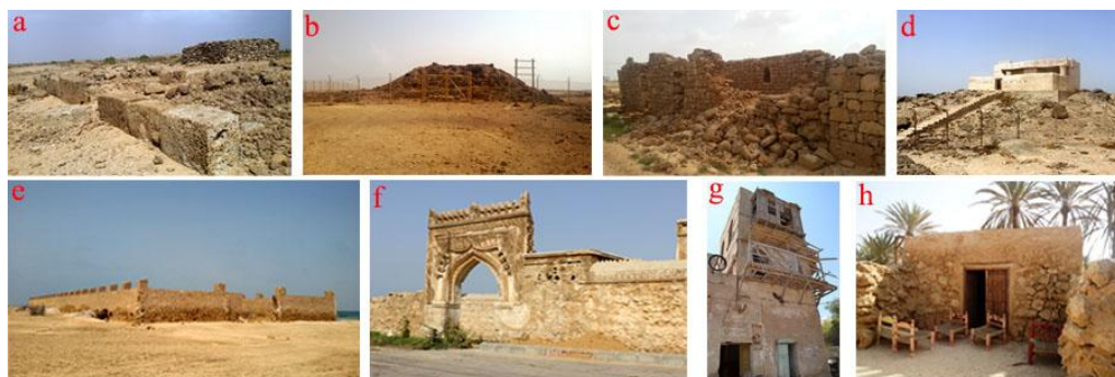
Fig. 4. Photographs showing the studied cultural heritage sites (a) El- Ghareen site, (b) Luqman mountain, (c) El Arady buildings, (d) Ottoman castle, (e) German House, (f) Hussein Al-Rifai House, (g) Abdullah Al-Rifai house, (h) one of Kessar's heritage houses

In addition, the Farasan Islands contain a number of military buildings represented in The Ottoman citadel that dates back to the period of Ottoman rule, and The German house that was established in 1901 to be a repository for coal used as fuel for vessels crossing the Red Sea.