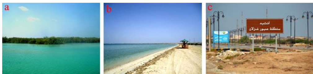
Fig. 3. Qandil Forest on Farasan Island, Coast of Hassis, the deer reserve

▪ Cultural Heritage sites: The Farasan Islands have many archaeological and historical elements (Fig. 4) which include a number of sites that contain some of the Stone Age artefacts. Some sites also feature the spread of pottery fragments on their surfaces, as well as other sites containing foundations of various buildings. An example of this is Al-Qurayyat, Al-Gharain, Al-Kadmi (in the village of Al-Kessar), Luqman mountain, Al-Baqr mountain, Muharraq, Wadi Matar and the village of Sayr.