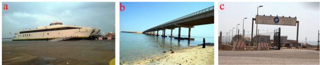
Fig. 7. Farasan ferry (a), the bridge connecting Farasan with Al-Sakeed (b), Farasan Saline Water Desalination Plant (c)

There is also a general hospital in Farasan and a number of mosques, gardens and green areas. It is noted that most of the main structure services are focused mainly on the Farasan Island.