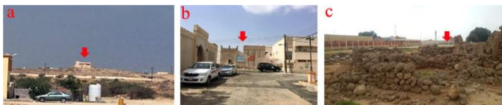
Fig. 6. Images illustrating the semi-detached urban area of cultural heritage sites, (a) the Ottoman Citadel, (b) the house of Ahmad Menawar al-Rifai, (c) Elarady buildings