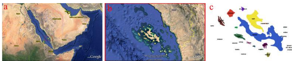
Fig. 2. General Map of the Red Sea shows the location of Farasan Islands (a) and details for the Farasan Islands (b), (c)

The Farasan Islands are located between the longitudes of 41 ° 20 ' - 20 ° 43' east and the 20 ° 16' - 40 ° 17' north latitudes, they are 42 kilometers south-west of Jizan and administratively linked to it, as shown in figure 2.