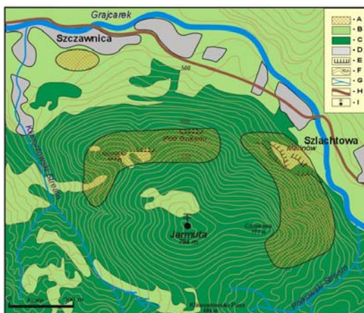
Fig. 4. Special areas of Jarmuta Hill (original drawing). Explanations: A – special areas, B – non-forest area, C – forest and thicket; D – buildings, E – quarries, F – contour lines, G – streams, H – main road, I – TV relay transmitter