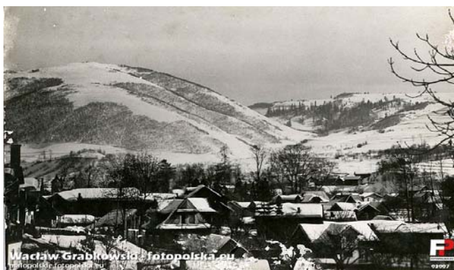
Fig. 5. Jarmuta Hill in 1967