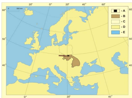
Fig. 1. The investigated area on the background of Europe. Explanations: A – investigated area, B – the Carpathian mountains, C – Poland, D – lands, E – waters.

The Jarmuta Hill is a characteristic, isolated hill elevated 794m a.s.l. in the Małe Pieniny Range (ca 21km 2 ) in the southern part of Polish Carpathians (Western Carpathians), occupying an area of approximately 1.5km 2 . The hill was already known to geographers in the 17 th century and was described in 1616 as Hermut, and then in 1667 as Jarmonta [3]. Altogether with Wdżar and Bryjarka, it forms a series of andesite intrusion arranged along the northern border of Pieniny [4]. The nearest famous resort is Szczawnica on the Grajcarek river, which is the northern border of the Jarmuta Hill. From the south-east, the hill is delimited by Palkowski stream, and from the south-west - by Klimontowski stream. The southern part of Jarmuta borders with the Małe Pieniny Range, which is mainly built from limestone. The shape of Jarmuta allows to distinguish three peaks (Fig. 2): the highest one, Jarmuta (794m a.s.l.), the eastern peak, Czuprana (777m a.s.l.), and the north-western peak, Jarmutka (690m a.s.l.). Currently, a conspicuous element in the area is the TV relay transmitter, which was installed in 1963 [3].