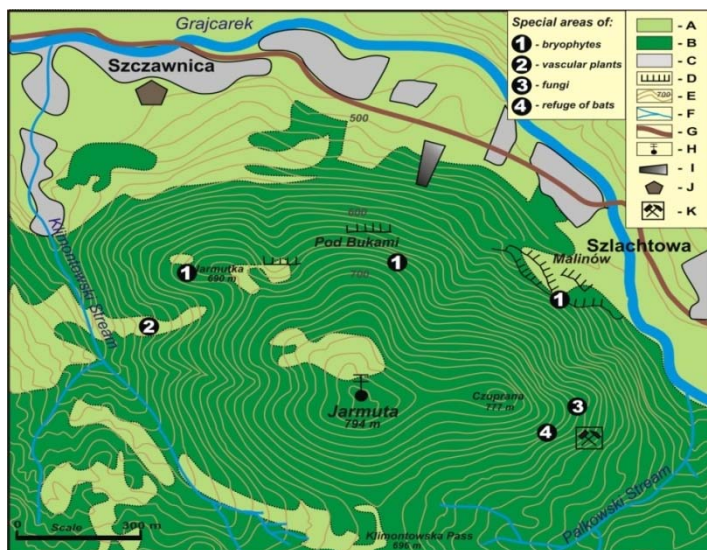
Fig. 2. Cultural and natural values of Jarmuta Hill (original drawing) . Explanations: A – non-forest area, B – forest and thicket, C – buildings, D – quarries, E – countour lines, F – streams, G – main road, H – TV relay transmitter, I – non-exist ski jumping hill, J – place with remains from the Bronze Age, K – adit.

The Jarmuta Hill is a characteristic, isolated hill elevated 794m a.s.l. in the Małe Pieniny Range (ca 21km 2 ) in the southern part of Polish Carpathians (Western Carpathians), occupying an area of approximately 1.5km 2 . The hill was already known to geographers in the 17 th century and was described in 1616 as Hermut, and then in 1667 as Jarmonta [3]. Altogether with Wdżar and Bryjarka, it forms a series of andesite intrusion arranged along the northern border of Pieniny [4]. The nearest famous resort is Szczawnica on the Grajcarek river, which is the northern border of the Jarmuta Hill. From the south-east, the hill is delimited by Palkowski stream, and from the south-west - by Klimontowski stream. The southern part of Jarmuta borders with the Małe Pieniny Range, which is mainly built from limestone. The shape of Jarmuta allows to distinguish three peaks (Fig. 2): the highest one, Jarmuta (794m a.s.l.), the eastern peak, Czuprana (777m a.s.l.), and the north-western peak, Jarmutka (690m a.s.l.). Currently, a conspicuous element in the area is the TV relay transmitter, which was installed in 1963 [3].