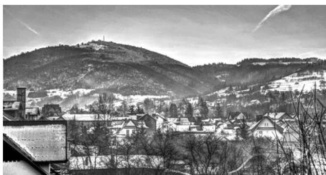
Fig. 6. Jarmuta Hill in 2017 (Photo by P. Chachuła, 2 January 2017)

The thickness of the sill is about 100m. It is built of fine-porphyritic amphibole andesite, which contains plates (up to a few mm long) of euhedral plagioclase and elongated phenocrysts